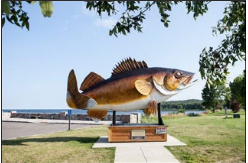
A 26-foot fiberglass walleye statue greets visitors at Mille Lacs Lake in Garrison, MN - Jenn Ackerman, The New York Times Photo.