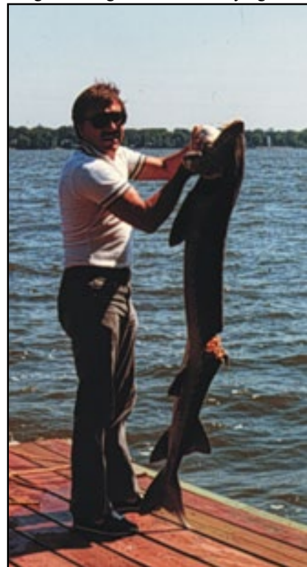
Lake sturgeon nearly cut in half, apparently by a large prop, in Mississippi River Pool 15 in the early 1980s