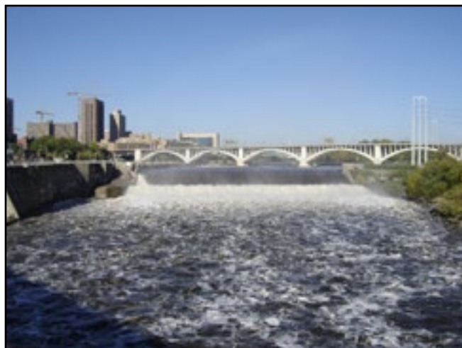
St. Anthony Falls Lock and Dam, MN

They note that these strategies can be used in combination with other strategies that specifically target carp without adversely affecting native species. Other strategies include construction of barriers that re-establish either watershed divides in artificially connected watersheds (ditches and canals) or natural barriers that would not adversely affect native biodiversity. Re-establishing natural barriers, such as Upper St. Anthony Falls on the Upper Mississippi River, is an example of reestablishment of a natural barrier.