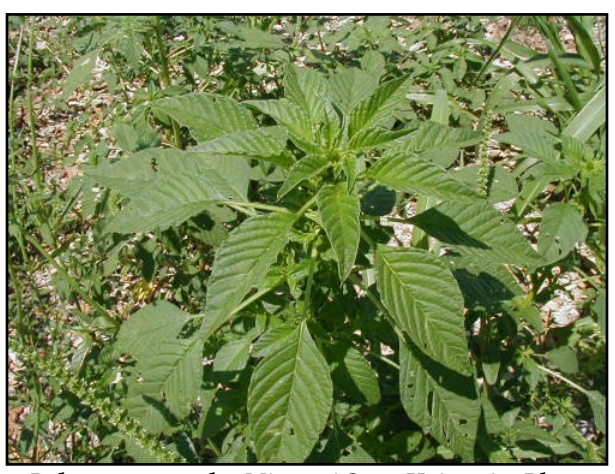
Palmer amaranth - Missouri State University Photo

Meanwhile, USEPA is likely to approve a Dow AgroSciences LLC's application to market a new version of its 2,4-D herbicide called Enlist which could also lead to an increase in pesticide use on the nation's fields. Farmers who grow corn and soybean are waiting to use the new product, which they