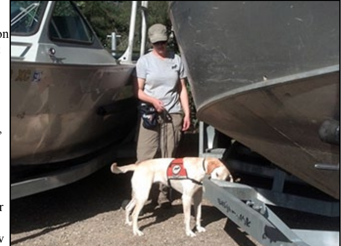
Mussel sniffing dog.

The dogs used by WDC have high levels of endurance and an obsession with fetching balls. That obsession is key, Whitelaw said. Only about one in 1,000 dogs screened from shelters and rescue groups are smart enough for the detective work and have the endurance to deal with sometimes long hours and long-distance searches. Size, intelligence and a good nose are also important factors, and some of the breeds the group has had success with include Labrador retrievers or Lab crosses, border collies, Australian or German shepherds, and Belgian malinois. "The dogs are having a good time. It's just a party," she said, adding that the dogs probably think, "You collect your silly human data and then we go play." To counteract any work fatigue problems with the play-for-reward system, human handlers often carry mussel samples or other things the dogs are trained to smell in order to ensure a reward. "We don't make them work without a find forever and ever," Whitelaw said.