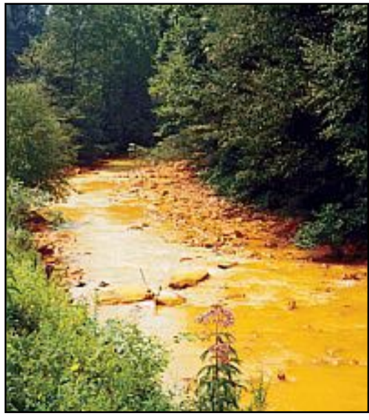
Acid Mine Drainage

Acid rain has steadily declined since the 1970s, when the government strengthened regulations of motor vehicle exhaust and sulfur dioxide emissions from coal-fired power plants, though it remains a problem in some rivers and streams in the eastern United States. Sulfur dioxide and nitrogen oxides cause acid rain, which in addition to polluting waterways can also erode buildings, sidewalks and other structures. High alkalinity is generally not considered an indicator of the overall health of a waterway. But the USGS study states that the higher alkalinity levels sampled in the rivers are a good sign because they measure a river's ability to neutralize acids in the water. The high acidity levels measured in rivers in the early 20th century reduced the alkalinity of some rivers and caused them to become more acidic, according to the USGS. The higher alkalinity also indicates that there are less harmful nitrates and sulfates in the water that often absorb alkalinity, according to the study, giving the researchers confidence that these rivers are in fact recovering