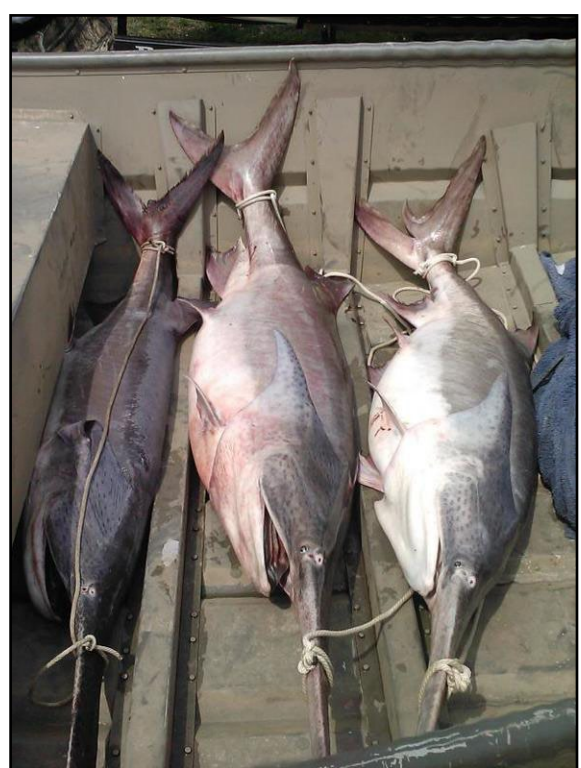
Harvested Paddlefish

Last November, in a separate case arising from the same investigation, Bogdan Nahapetyan, 35, of Lake Ozark, MO, pleaded guilty to the same offense. Nahapetyan had numerous interactions and conversations with undercover investigators concerning the purchase of female paddlefish and paddlefish eggs. Although the investigators informed Nahapetyan numerous times that