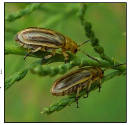
Tamarisk beetles

Tamarisk, an invasive tree species in the West, can consume up to 200 gallons of water a day, contributing significantly to drought conditions, and can actually dry up and destroy small trout streams. Arizona is now using a small beetle to kill the tamarisks and fight drought conditions. Officials say the centimeter-long beetle – which was released in Arizona a decade ago – could help maintain water levels in the Colorado River. "We're all looking at ways to increase the flows from the Colorado," said David Modeer, the general manager for the Central Arizona Project , a public agency that said in June that it might have to cut water deliveries to some cities by 2020 if the state can't reduce its water consumption. "Every drop counts," Modeer added. Still, some observers said the beetle won't kill every tamarisk tree and could harm other plants as it spreads across the state. "You'll never get the last tree," said Gibney Siemion, an ecologist with the Grand Canyon Wildlands Council . "You do your best, but the tamarisk is very adaptable."