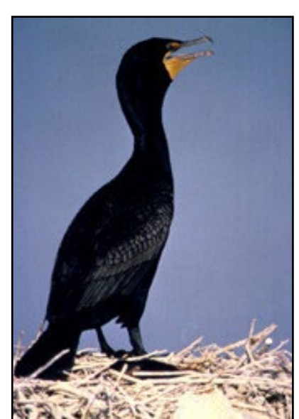
Double Crested Cormorant

Sources: Associated Press, 8/1/14; and Greenwire, 8/4/14 BACK TO TOP