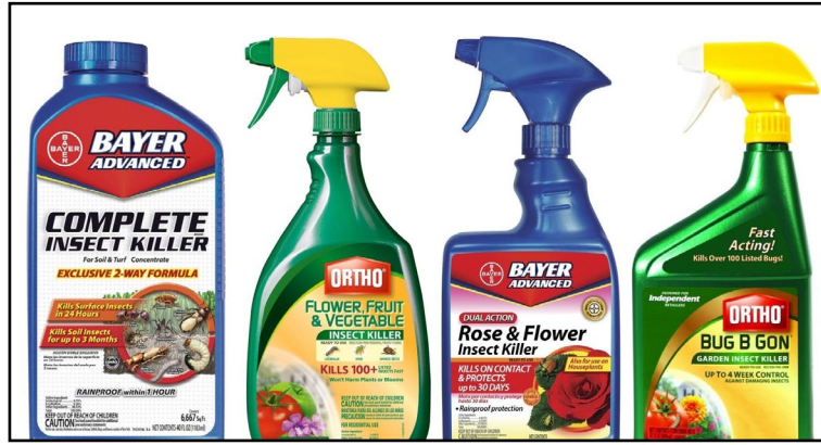
There are many neonicotinoid containing insecticides on the market. These are a few that are commonly used around the home.