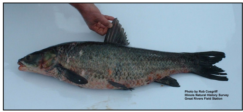
Black carp