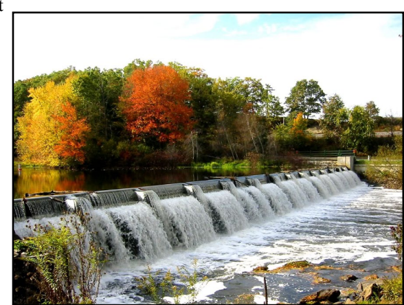
Small Scale Hydropower Project

"The United States has tremendous untapped clean energy resources and responsible development will help pave the way to a cleaner, more sustainable and diverse energy portfolio," Energy Secretary Ernest Moniz said in a statement. Responsible development was a focal point of the study. The assessment analyzed technical, socioeconomic and environmental characteristics of potential hydropower facility locations, and included streamand river-specific information on local wildlife habitats, protected lands and fishing access areas. DOE emphasized that most of the new hydropower facilities that could tap into this unused capacity would be smaller operations. Large hydropower projects have been controversial in the United States