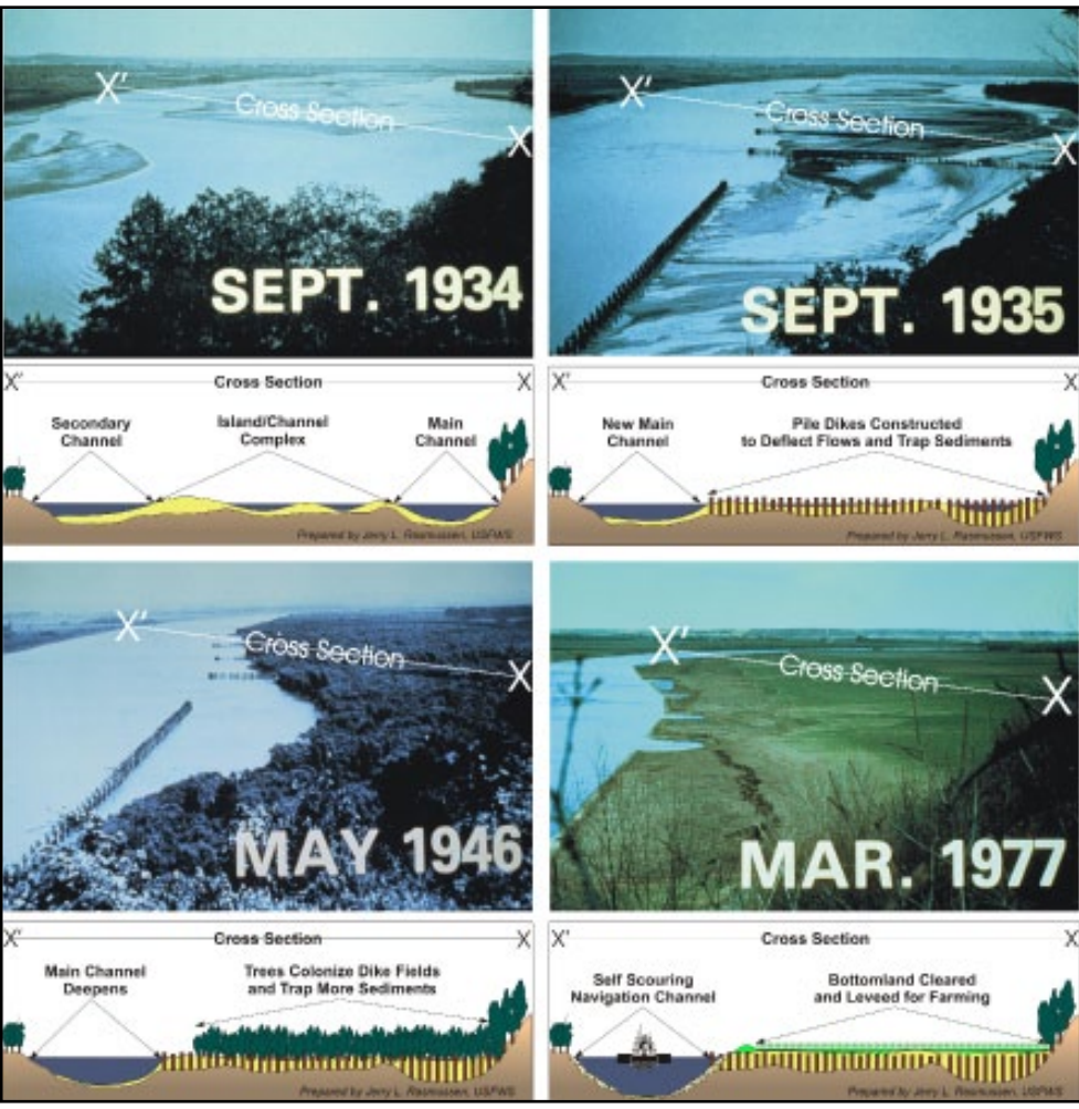
Graphic showing how the Missouri River floodplain was transformed by the federal bank stabilization and flood control project at Indian Cave Bend, NE. Natural habitats and floodplain flood storage capacity were eliminated when adjacent farmers claimed, cleared and leveed floodplain forests for farming. What was once public river floodplain lands was thus converted into private holdings. This occurred along much of the Missouri River downstream from Sioux City, IA. The natural flood storage capacity of the river's floodplain was thus eliminated along with most of the river's wildlife and fisheries habitats.

But in order to fully understand this situation, one needs to recognize where much of the at-risk "private farmland" came from in the first place. It was and always will be part of the "Wide Missouri's" floodplain. It only became "farmland" after the Corps channelized the River in the 1930s as shown in the accompanying figure. The fallacy of that move became clear during the 1993 and 1994 floods when the river broke out of its "straight jacket" of levees and flooded bluff to bluff in both years. Additional flooding has occurred in recent years as claimed by the plaintiffs. But the floods of 1993 and 1994 caused common sense to return when some of the landowners chose to sell their land and allow it to be returned to a more natural state in order to absorb some of the flood waters when the great floods return. Those government buyouts also generated benefits for native wildlife. The need for returning a portion of the floodplain to a more natural state is clearly outlined in the "Galloway Report"