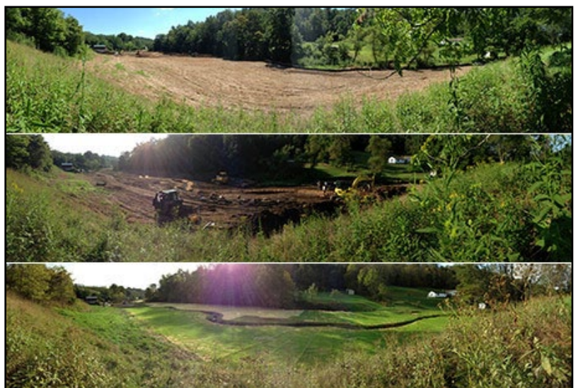
Before, during and after views of the Grave Creek mitigation site east of Cameron, WV developed as mitigation for a construction project.