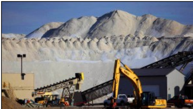
Typical large Wisconsin sand mine.

The case is the third involving a sand mine since mid-December. Altogether, the parties have agreed to pay $360,000 to settle. The sand mining industry has grown sharply in recent years with the surge in hydraulic fracturing or fracking where the sand is used. But with that growth, some companies have run afoul with state environmental laws, and the Department of Natural Resources has referred six pollution cases targeting the industry to the Justice Department, and three referrals have come since August. Western Wisconsin sand has the characteristics that the oil producers seek for fracking.