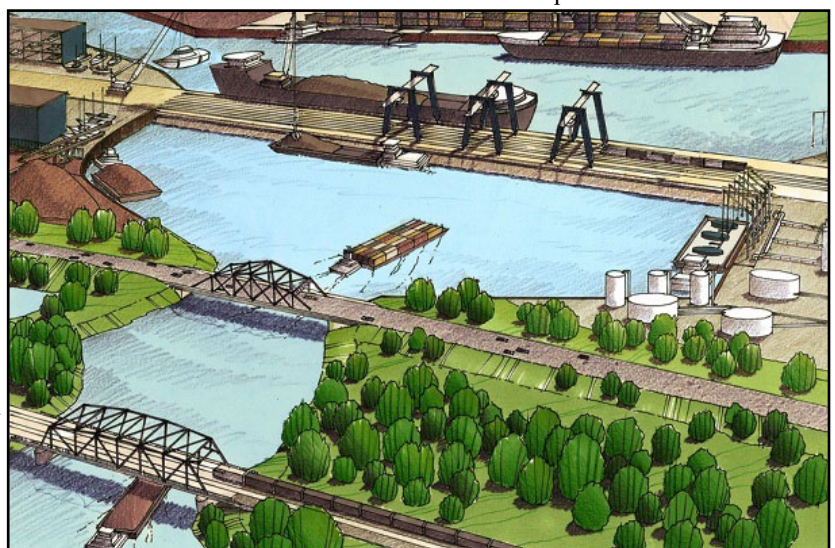
Diagram showing how a hydrologic separation along the Calumet River (top) could still allow for transfer of cargo and shipping along the CAWS (bottom). Sketch taken from the GLC Study Report.

In early February Rep. Candice Miller (R/MI) introduced H.R. 4001, the Defending Against Aquatic Invasive Species Act of 2014 . If passed, this legislation would direct the Corps to create a physical barrier between the two watersheds. “...I believe total separation is the only way to make sure that Asian carp do not enter the Great Lakes,” Miller said in a press release. “This project will require the buy-in of stakeholders from across the