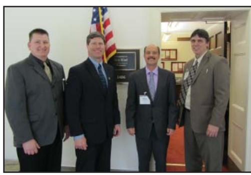
Rep. Kind (D/WI) co-sponsored a briefing by MICRA on aquatic invasive species.

I encourage you to continue raising awareness by meeting with your state and federal congressional members at their local offices.